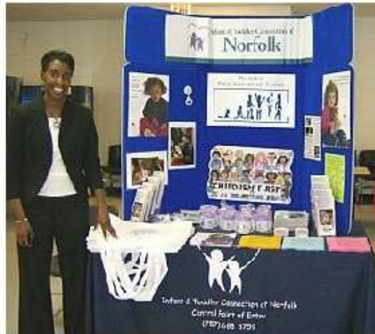
Infant & Toddler Connection of Norfolk