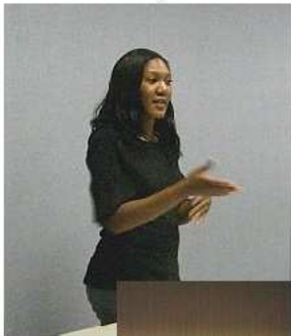
The Planning Council giving the USDA recordkeeping