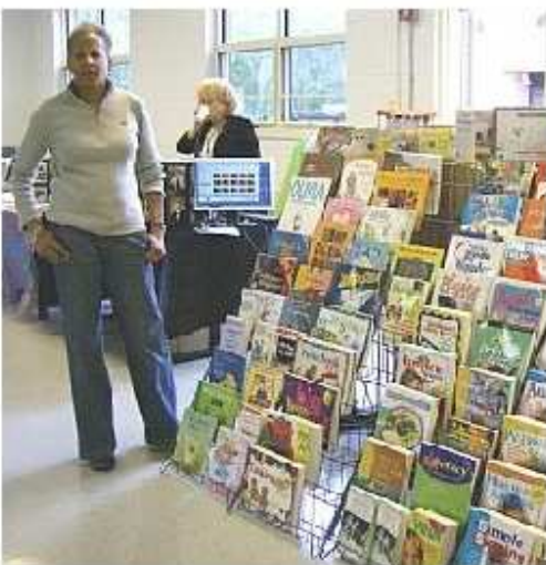
The Children's Toy Connection