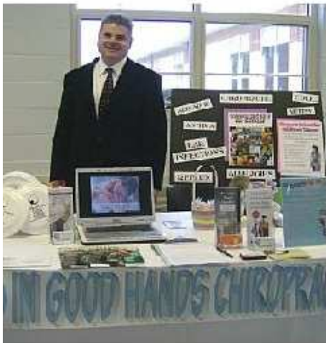
In Good Hands Chiropractic