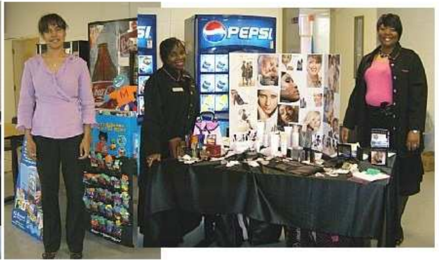
Abrams Learning Trends