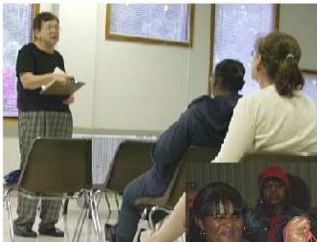
Places & Programs giving the USDA recordkeeping