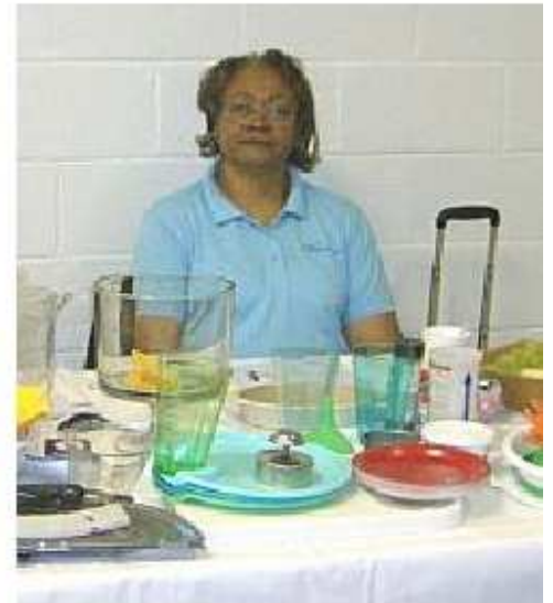
The Pampered Chef