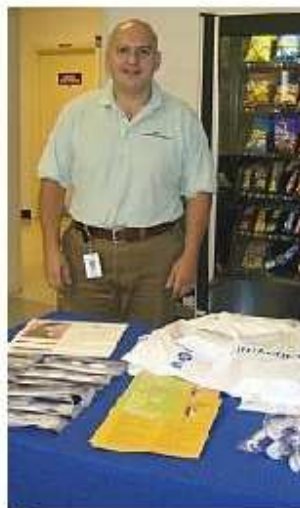
Anthem Health Keepers